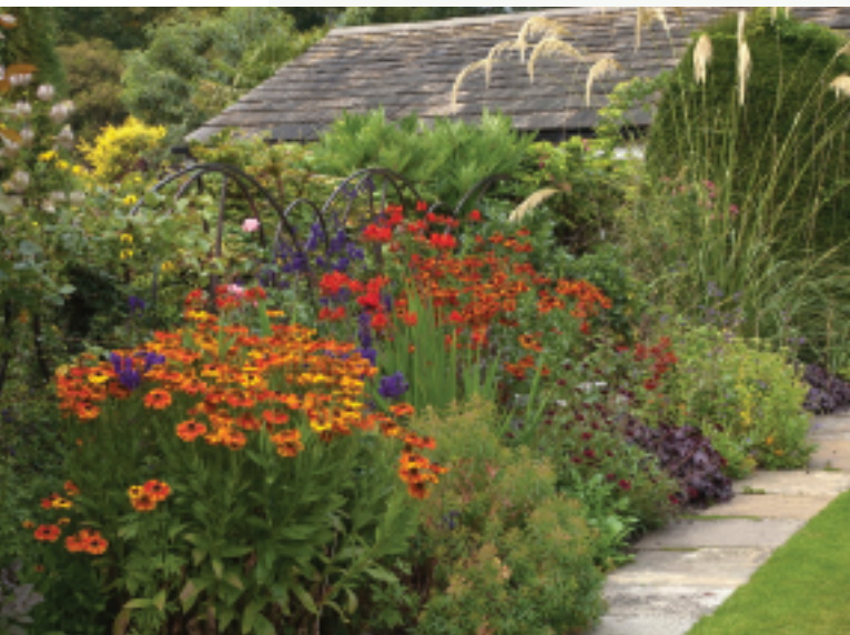
The front garden, York Gate